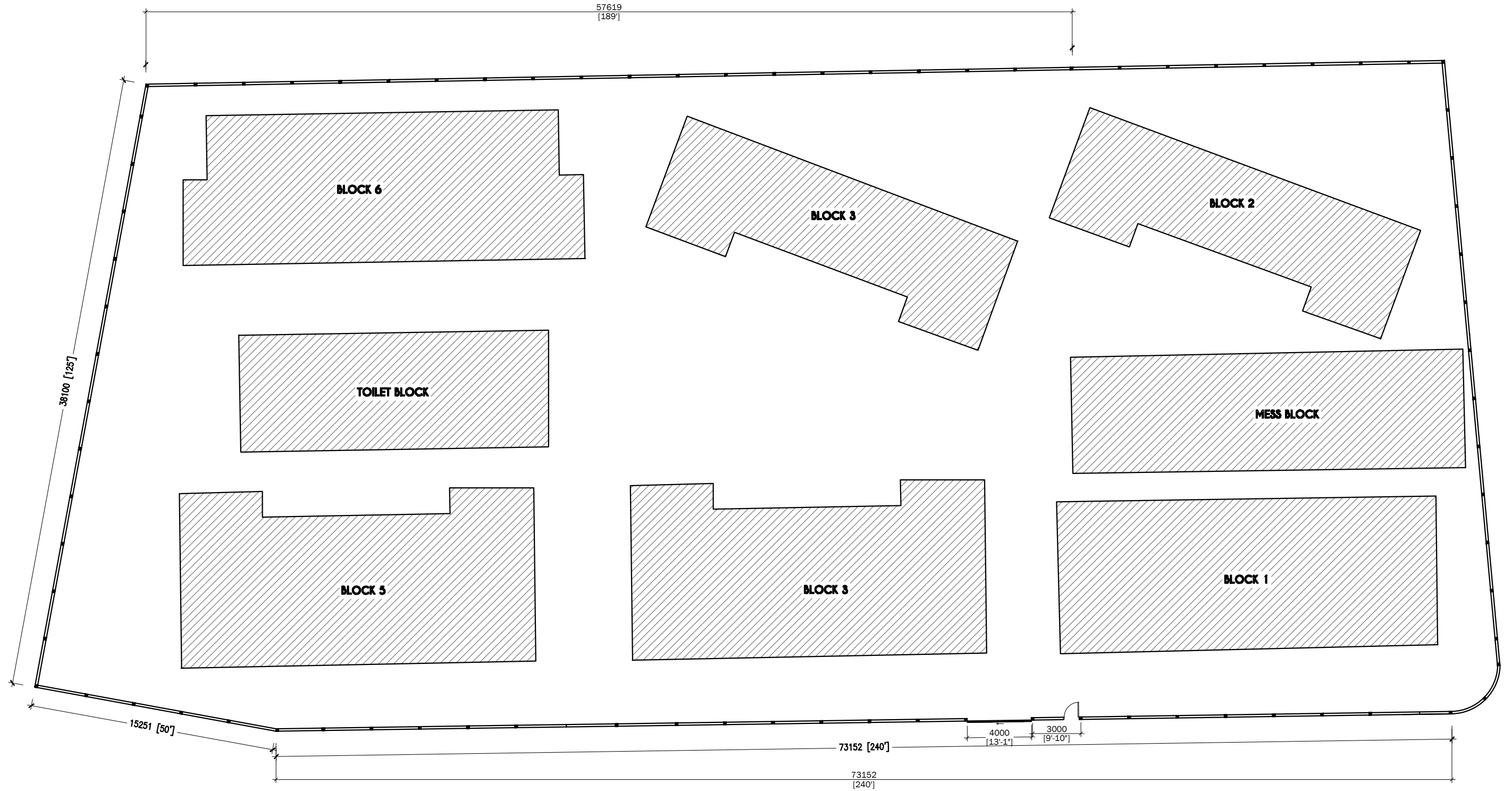
HULHUMALE FACILITY - SITE PLAN SCALE 1:250