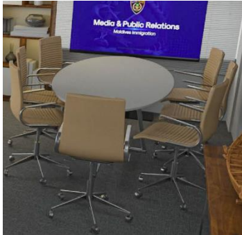
2.3.3 Executive meeting table