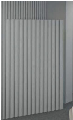
2.2.6 PVC side panel & concealed door