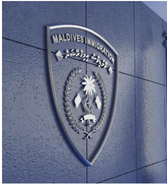
2.2.8 Feature wall logo