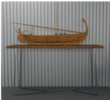
2.3.8 Low cabinet