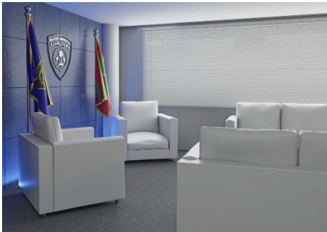
2.3.6 Sofa set