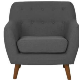
2.3.5 Waiting area single sofa