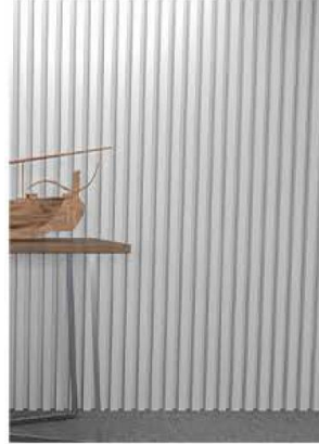
2.2.4 PVC Panel