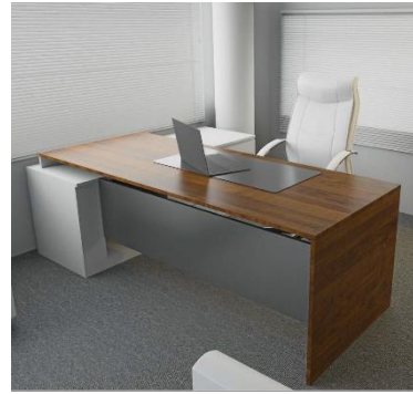
2.3.1 Executive table