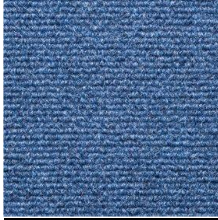
2.1.2 Blue Carpet