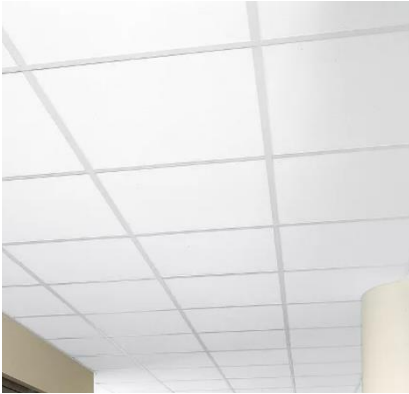
2.1.3 Ceiling Board