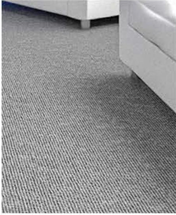
2.1.1 Gray Carpet